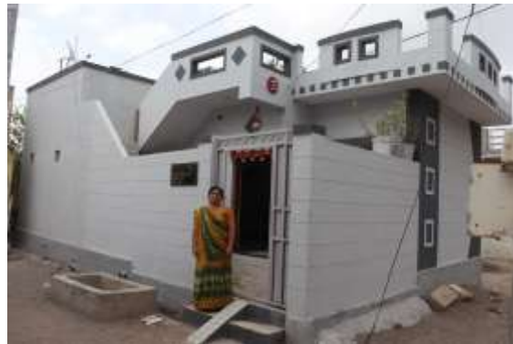
Housing under BLC- PMAY Gujarat