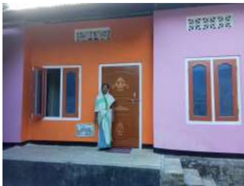
Housing under BLC-PMAY- Assam

Structured visits to in-situ improvement, resettlement and rehabilitation projects, livelihood and technological options relevant to the programme will be organized to impart practical experience to the participants. The visits to projects implemented by Central and State Governments, major public and private sector undertakings, NGOs and CBOs will also be undertaken.