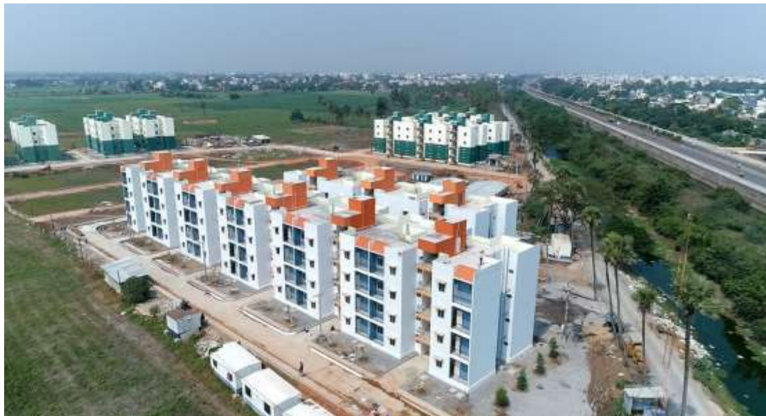
Affordable Housing under PMAY at Tenali- HUDCO Project

The mobility options and access to basic services is essential for the efficient functioning of our cities and towns, as they expand. The issues of multimodal transport options, urban livelihoods and financial inclusion through micro-finance have been addressed and discussed. The use of Information and communication technology for connectivity and security in human settlements is crucial for the growth of digital India. Effective formal solutions are crucial for the success of urban development particularly in metropolitan areas. The role of government is of a facilitator for improving the affordability of various alternatives of structurally safe housing typologies, adhering to planning norms and establishing linkages with the city infrastructure services. There is a need to develop processes and tools to protect the social, economic and cultural fabric of the people who have been living in informal settlements. The course on “Formal Solutions to Informal Settlements” looks into these challenges of informal settlement and the various interventions including innovative solutions to deal with such issues being faced by most of the cities of the developing world.