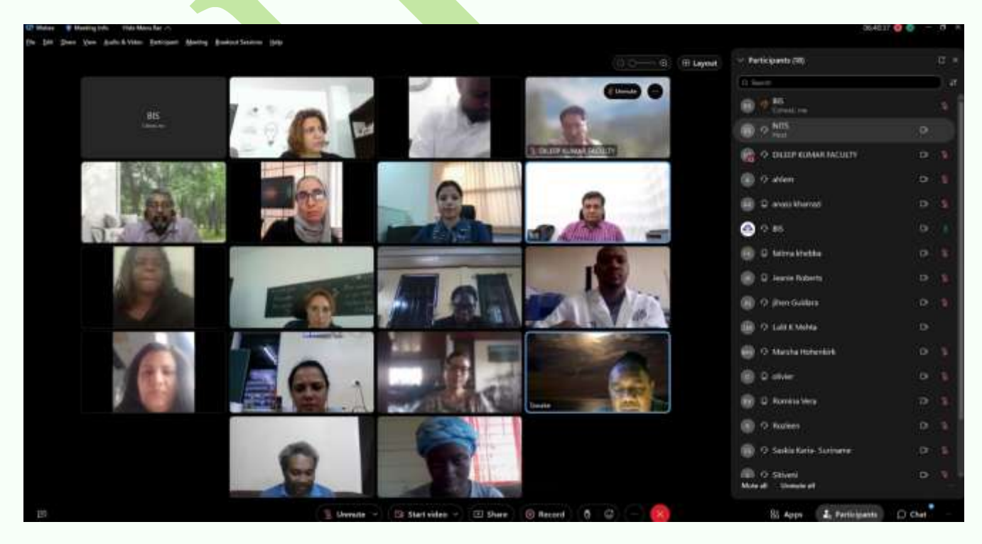
Online ITP on Laboratory Quality Management System